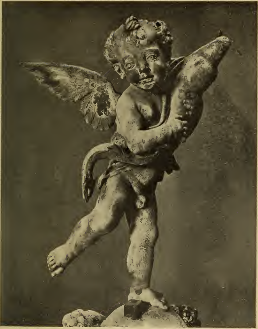
PUTTO WITH DOLPHIN

FROM THE BRONZE BY VERROCCHIO IN THE PALAZZO VECCHIO